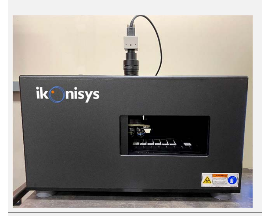
EXHIBIT 2: THE ICONISCOPE20

The entire scanning process is efficiently controlled by hardware and imaging algorithms. This allows slides to be scanned quickly while producing high quality, optimally focused and exposed images of cells that appear malignant. This automation of workflow significantly reduces dependence on the subjective skills of laboratory staff.