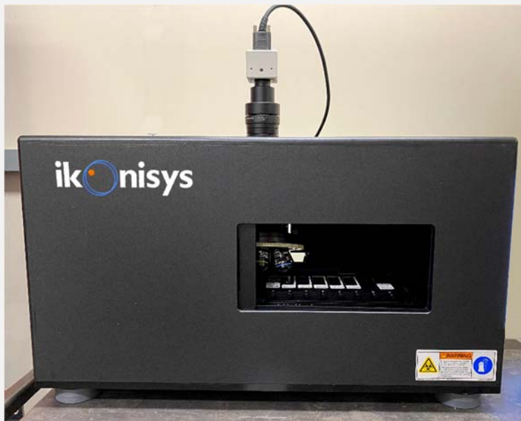
FIGURE 2: THE ICONISCOPE20

The entire scanning process is efficiently controlled by hardware and imaging algorithms. This allows slides to be scanned quickly while producing high quality, optimally focused and exposed images of cells that appear malignant. This automation of workflow significantly reduces dependence on the subjective skills of laboratory staff.